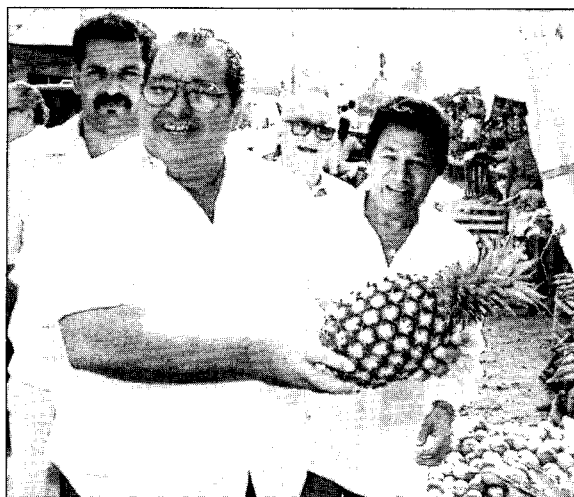
Guillermo Endara has found that governing Panama is more difficult than picking a ripe pineapple.

It was this kind of unbridled gratitude that, days after the invasion, typified most