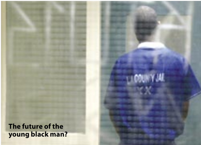
The future of the young black man?

participation of low-education black men in American society. Democracy and civil society are diminished and that is a collective loss."