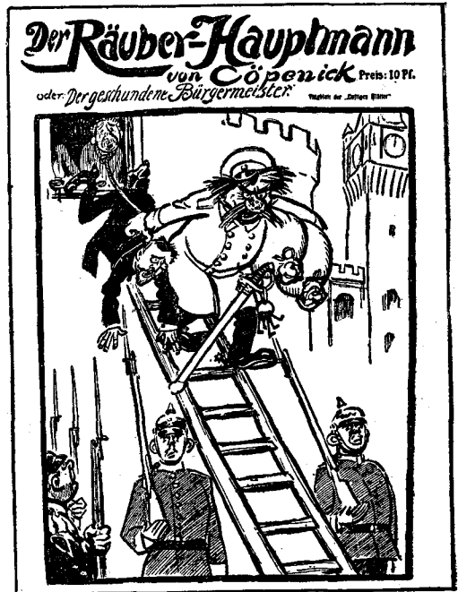
THE POSTCARD POET AND ARTIST ON THE AFFAIR HAULING THE BURGOMASTER FROM THE TOWN HALL Some of the many extravagant "Köpenick" cartoons which have been produced in Germany.