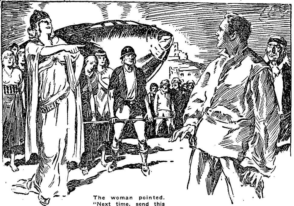
The woman pointed. "Next time, send this man," said she