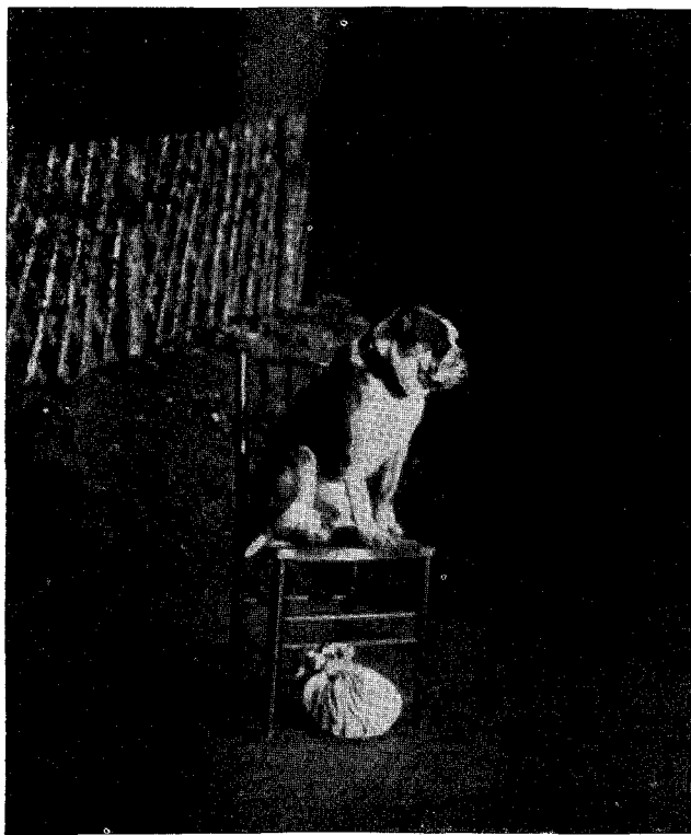
"WHERE'S THAT PLUM PUDDING?"

Again, to pursue this somewhat ungracious, but not, we think, unessential protest against the sub-titles, it would scarcely have occurred to everyone to describe Mr. G. F. Watts as "The Painter of Love and Life." It would rather appear that if there is one characteristic which really separates Mr. Watts from the majority of symbolic or ideal artists it is the fact that he is less inspired by those softer and more human influences which we associate with love and life, and more by those terrible abstractions of order and judgment which avenge without anger and bless almost without benignity. Mr. Watts' moral spirit is noble and inspiring, but it often has about as much to do with love and life as the first book of Euclid, which is also a noble and inspiring work when properly understood. It is supremely significant that the greatest work of Mr. Watts, and something very like the