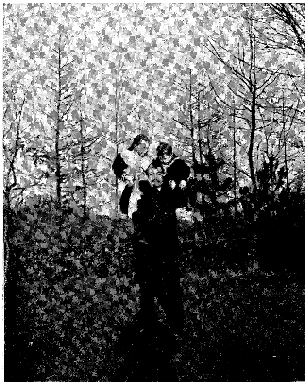
DR. CONAN DOYLE AND HIS TWO CHILDREN IN THE GARDEN AT HINDHEAD.

or so we say. And yet among the more self-reliant, more boisterous types in the living world around us, is there one that is more real than Dorothea?